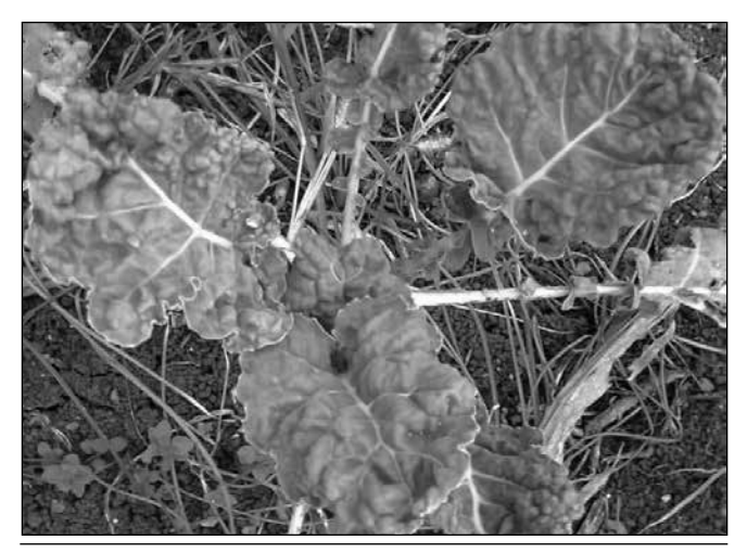
Fig. 2. Symptoms associated with natural infection by TuMV on kale plant.

Fig. 2. Síntomas asociados con la infección natural por TuMV en plantas de Brassica oleracea var. acephala .