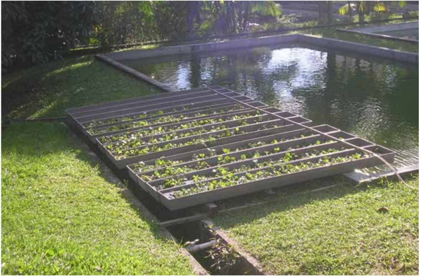
Fig. 1. Experimental setting. Fig. 1. Diseño experimental.

tank was 24 hours. The efficiency of the system was evaluated through measures and analyses of physical and chemical variables of wastewater.