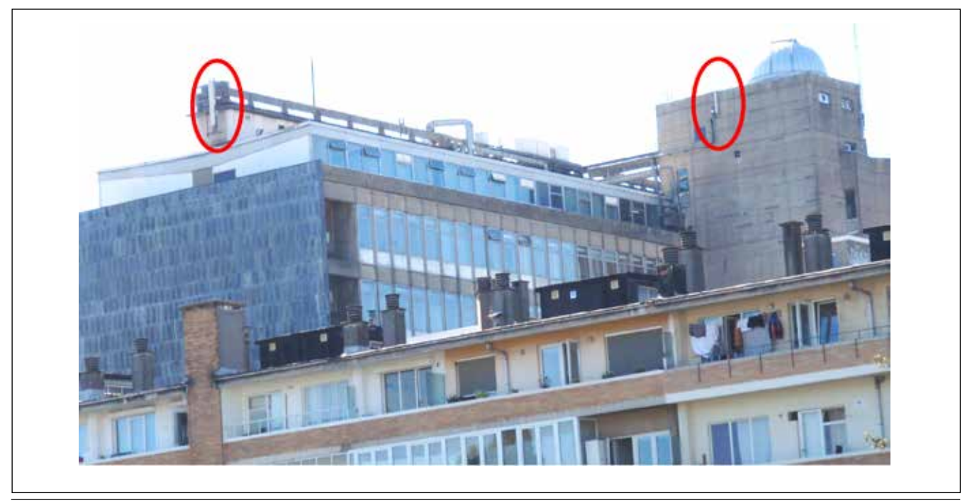
Fig. 1. The two communication masts causing most of the electromagnetic field of 70 – 100 μW/m<sup>2</sup> in one of the experimental rooms. Fig. 1. Los dos mástiles de comunicación causantes de la mayoría del campo electromagnético de 70 – 100 μW/m<sup>2</sup> en una de las salas experimentales.

Germination did not occur under 70 - 100 \mu W/m<sup>2</sup>. After four days, the seeds set under the two different electromagnetic field strengths already differed: those under the lower level had begun to germinate while those under the higher level of electromagnetic field had not at all done so. After seven days in total, many seeds maintained under low level of exposure had completed their germination and other ones were in the process of their germination while the seeds set under the higher level of exposure appeared unchanged (when looking at them from above) (Fig. 2 A). The experiment was continued until a total of 10 days with, at that time, the same results as above: normal germination for the seeds under low radiation, apparently no germination for those set under the higher radiation.